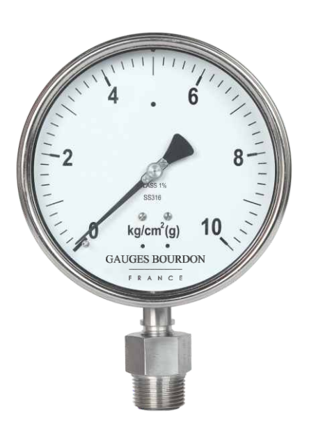
SEAL WITH PG