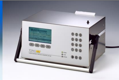
Particle Counter LAP340