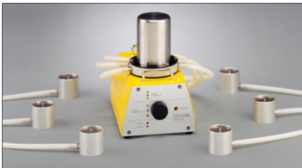
Aerosol Distribution and Dilution System ADD 536

Hospital operating rooms are specially designed to avoid contaminations and therefore additional infections of patients during operations. To assure a low level of particle contaminations a laminar air flow is applied to the operating table. To verify the retention efficiency of this flow regime a verification with a defined test aerosol is required according to the standards DIN 1946-4 and SWKI 99-3. For that reason a total particle rate of 6.3 \cdot 10^7 P/min has to be distributed to six different positions and emitted with a reliable long term stability. From the standards it is also required that this total particle rate is continuously monitored and controlled by a particle counter. The Topas Aerosol Distribution and Dilution system ADD 536 meets all these required demands for providing a defined test aerosol with the following features: