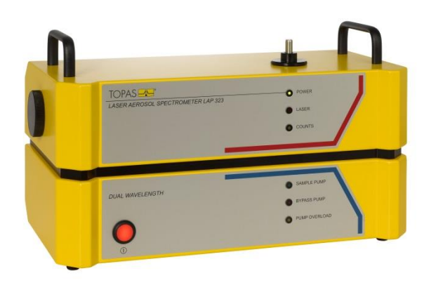
Laser Aerosol Spectrometer LAP 323.

With the new single particle scattering light spectrometer LAP 323 the innovative dual wavelength technology of Topas GmbH for particle size and number determination is implemented.