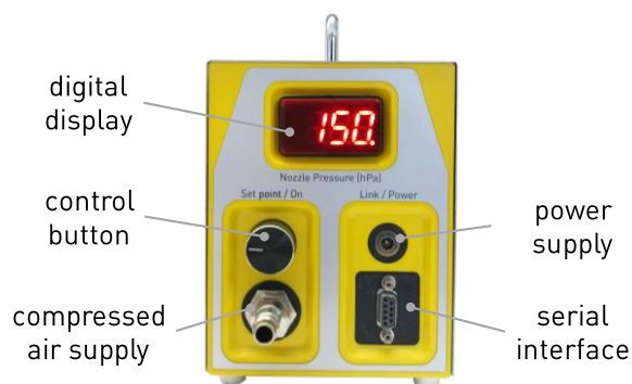
Operation and display elements of ATM 222.

Tarik et al. (2017) A Practical Guide on Coupling a Scanning Mobility Sizer and Inductively Coupled Plasma Mass Spectrometer (SMPS-ICPMS). J. Vis. Exp., 2017, 125, doi: 10.3791/55487